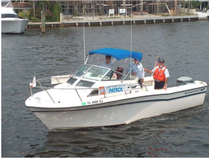
The Flying Tiger – Bob Tust Coxswain & Crew On Patrol