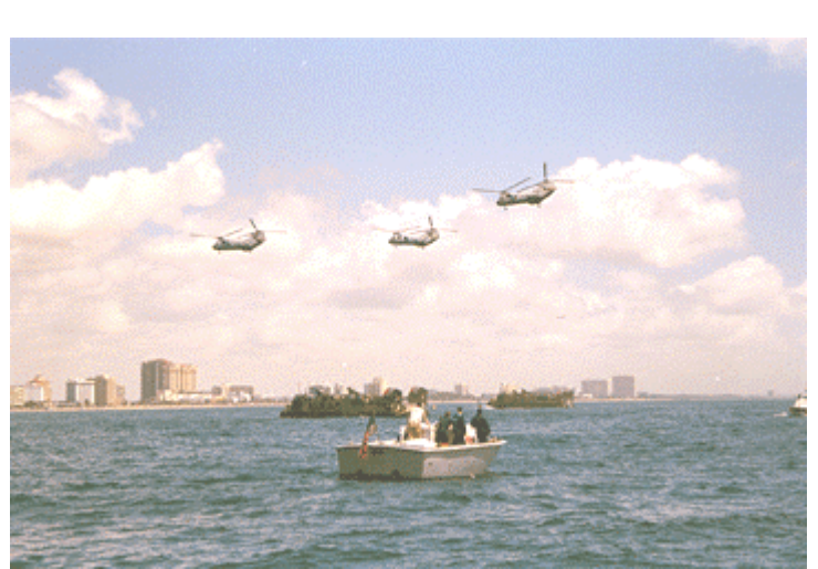
The McDonald’s Air & Sea Show is just around the corner (May 2,3,4,5) 2003