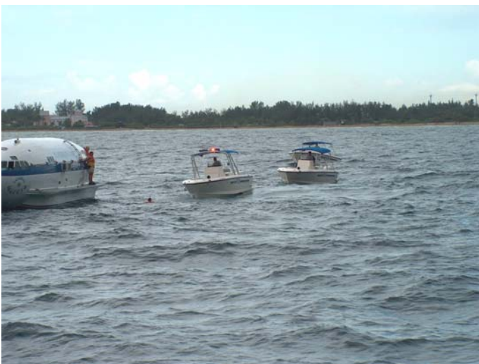
Picking up victims from the fuselage. Can you see the victim's head in the water?