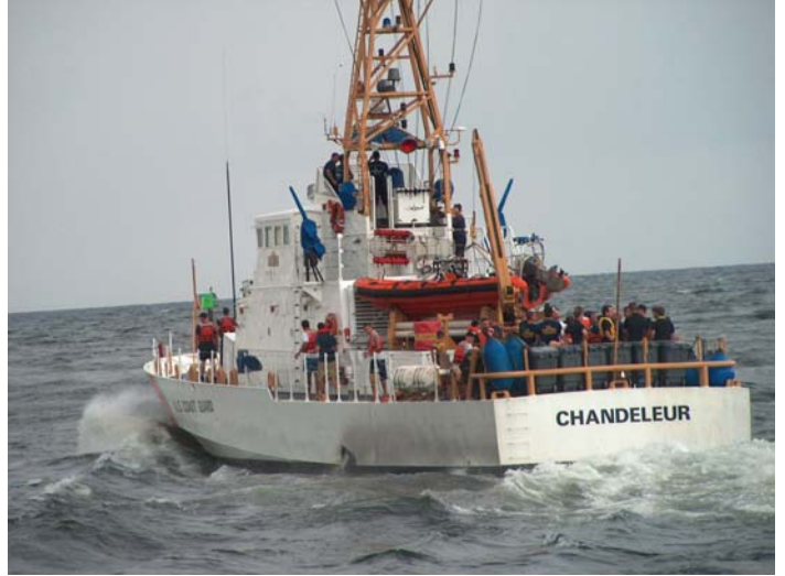
CG Chandeaur heading to station.