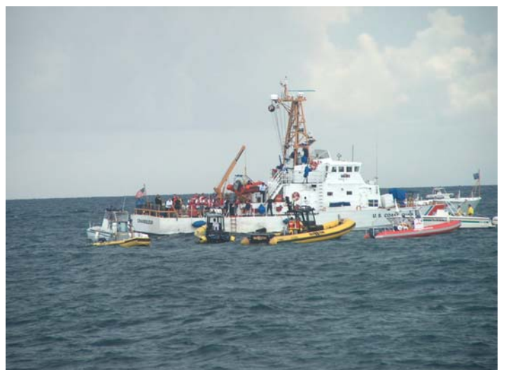
Picking up victims that had drifted from the fuselage.