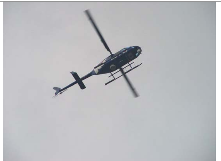
And by Air.