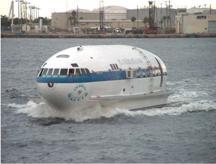
Cosmic Muffin heading to station.