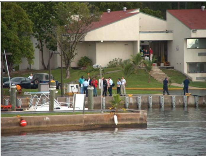
Even the Media was there by Sea.