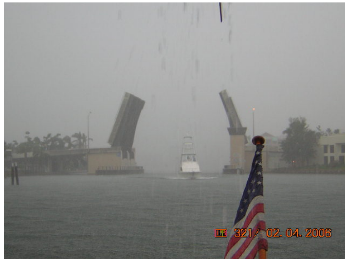
Sunshine State? Not during this patrol!