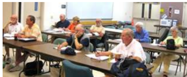
AUXWEA 09 Class

All AUXOP classes will be on Wednesday evenings at the base at 1900. Operations classes are on Tuesday evenings, same time