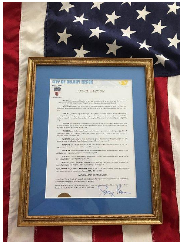
Flotilla 36 received “National Safe Boating Week” Proclamations from Delray Beach Mayor, Shelly Petrolia (shown here) and Boca Raton Mayor Scott Singer.